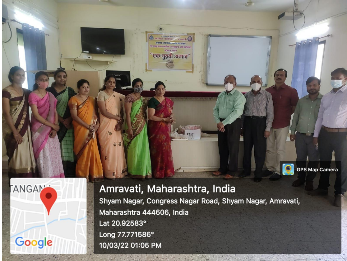
Ek Mutthi Anaj Inauguration Programme Present Staff