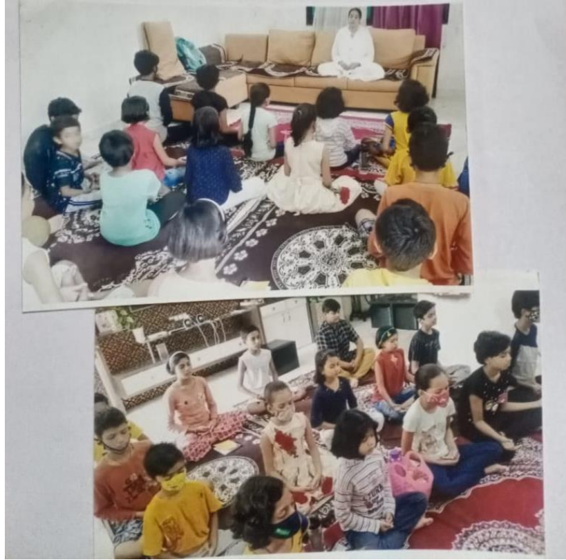
Bothi Tree student Perform Meditation