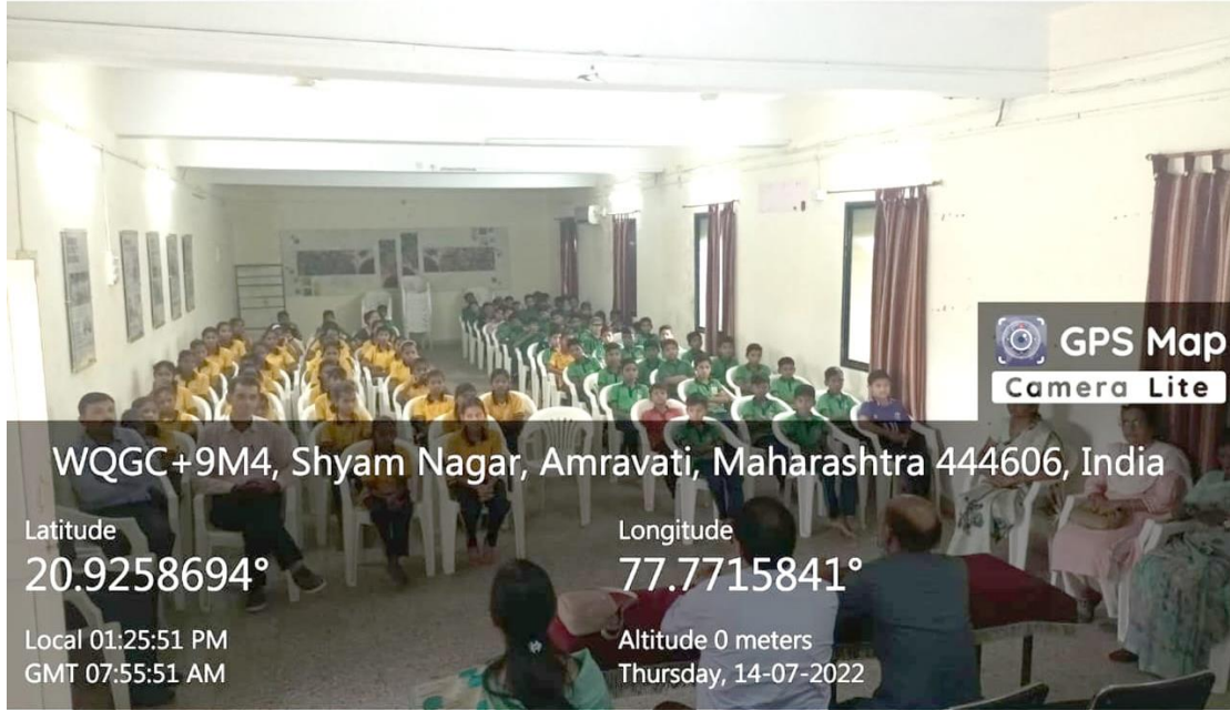
Students Perform Meditation

interest towards enabling such kids to cope with the present atmosphere.