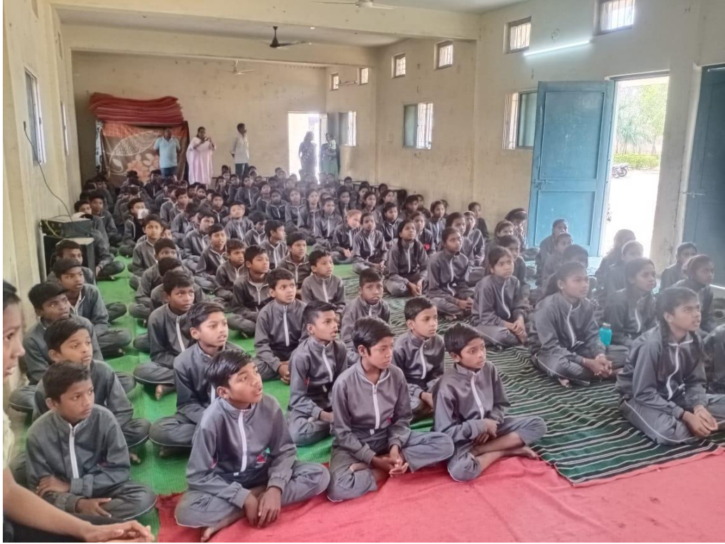
Present students during the Guest lecture