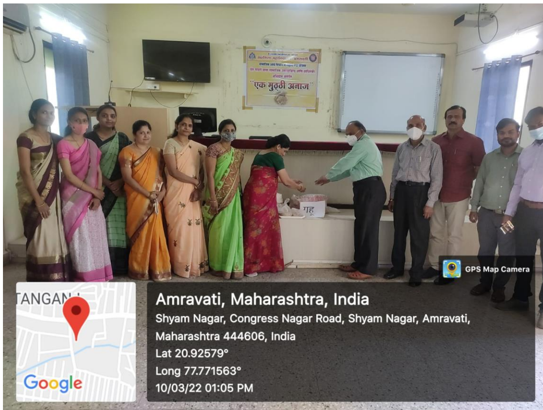
Ek Mutthi Anaj Inauguration of Hon'ble Secretary Shree DGCT Amravati

Despite these challenges, the "Ek Mutthi Anaj" charity initiative has been successful in making a positive impact on the society, and efforts are being made to address these challenges and improve the program's effectiveness.