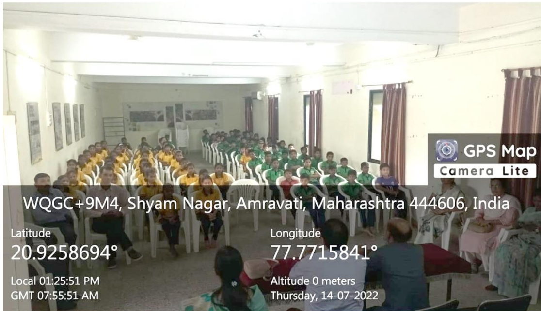
Students Perform Meditation