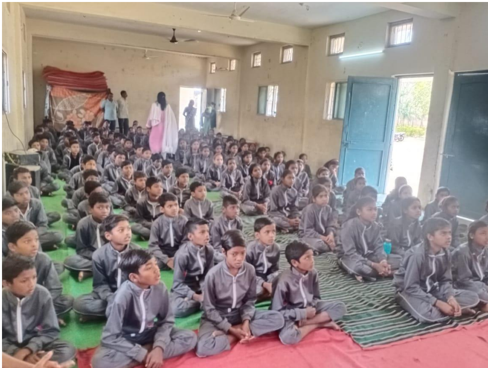
Present students during the Guest lecture