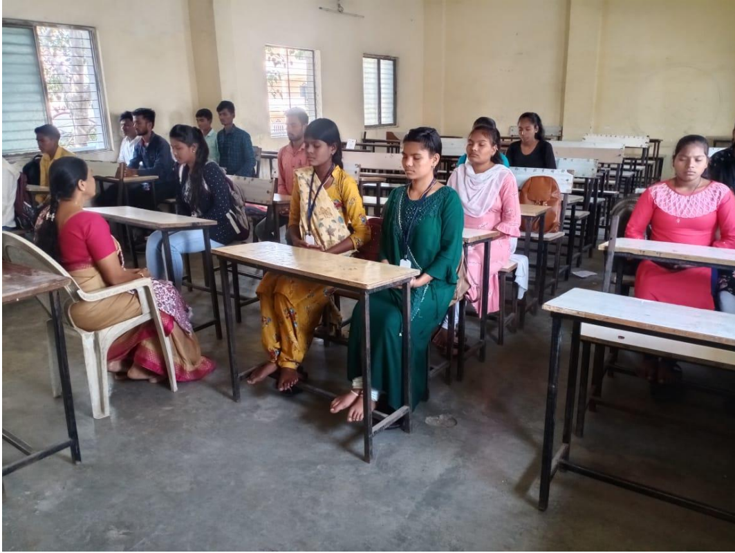
Students Perform Meditation